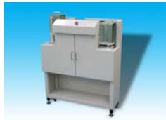
KH8300 Pallet Auto-loader