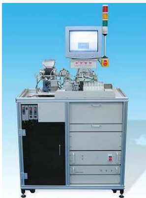
KH5303 Pi-network In-process Tester (SMD Crystals)